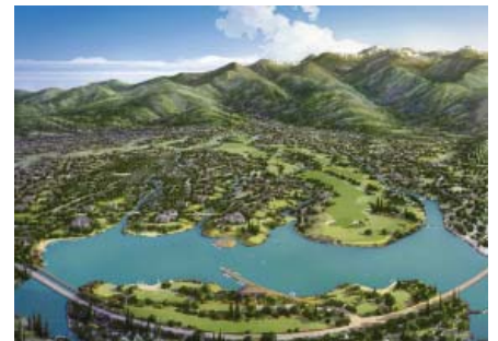
Mountain Destination Resort Kazakhstan