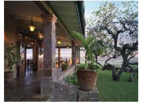
Singita Grumeti Reserves Sasakwa Lodge Grumeti Reserve, Tanzania

On 50 oceanfront acres, the 600-room resort hotel is sited among lush gardens and lagoons in a traditional Hawaiian architecture reminiscent of the 1920s and 1930s. The design evolved as a response to the island's climate, terrain and lifestyle. Environmental considerations have played a large part in the design and operation of the resort. At a very early stage in the development and design, hotel personnel collaborated with the design team, community leaders and government officials to address the issue of environmental responsibility. The result is a resort that respects its surroundings and provides opportunities for its visitors to learn. The property is repeatedly rated the best among the more than 100 Hyatt hotels in the world.