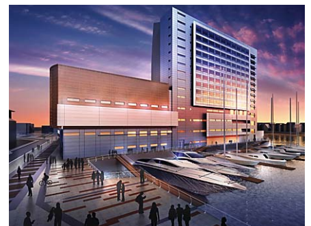
Ocean Village Southampton, United Kingdom