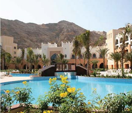
Shangri-La's Barr Al Jissah Resort Muscat, Oman