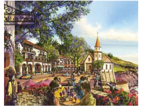
Quinta do Lorde Resort Hotel Madeira, Portugal

This 150-room resort in St. Thomas was designed to be self-sufficient with its own generators, desalination plant and sewage treatment facility on-site. A gutter and pipe system allows rain water to be saved for irrigation and fire protection. Indigenous shrubs, trees and a fragile salt pond have been preserved for their ecological and aesthetic value. Selected as the number one resort in the Caribbean by Condé Nast Traveler magazine.