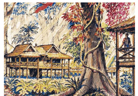
Amazon Jungle Lodge Brazil