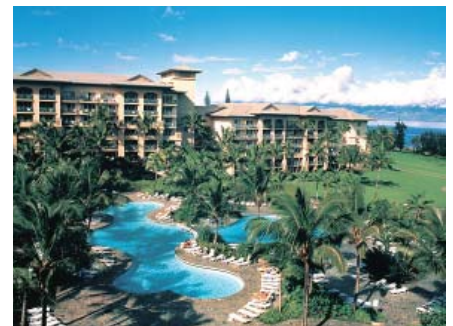
The Ritz-Carlton, Kapalua Hawaii, USA