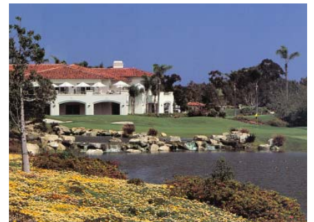
Four Seasons Aviara Resort Carlsbad, California, USA