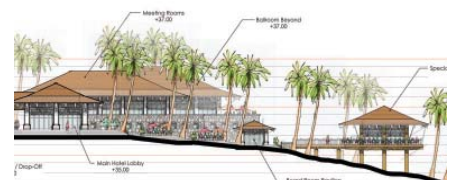
Hampstead Estate Dominica