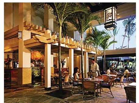
Hilton Hawaiian Village Honolulu, Hawaii, USA