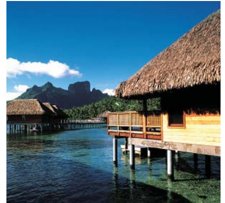
Hotel Bora Bora French Polynesia

This project is a prime example of a project that was ahead of its time in terms of environmental sensitivity. WATG designers first began work on the project in 1965 and created an unobtrusive resort using indigenous materials and styles. The 75-room hotel, designed in the traditional style of the Tahitian fare (house), sits over a pristine coral reef and does not overwhelm its surroundings. The open-air buildings, cooled by prevailing trade winds, have bamboo walls with screened openings and roofs constructed of lauhala thatching. The property is repeatedly rated among the top ten resorts in the Asia Pacific region.