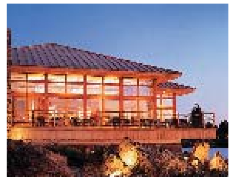
Broken Top Golf Clubhouse Bend, Oregon, USA