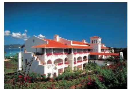
The Ritz-Carlton, St. Thomas US Virgin Islands