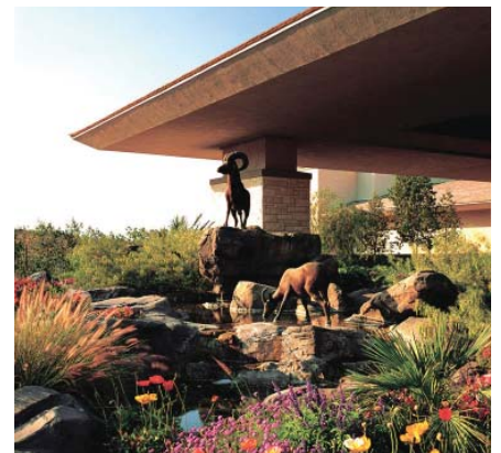
The Ritz-Carlton, Rancho Mirage Rancho Mirage, California, USA

Preservation of a hillside and of the tropical foliage were primary concerns in planning and designing this 190-room resort hotel. Construction is camouflaged by tropical foliage; guestrooms descend on a cliff. For public areas, an indigenous design in the form of a low Polynesian long house was adapted to keep the structure totally Polynesian in flavor.