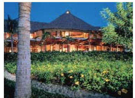
Four Seasons Hotel and Resort Punta Mita, Mexico