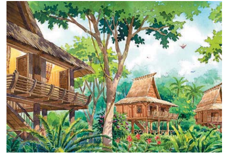
Sanctuary Bay Resort Stann Creek District, Belize