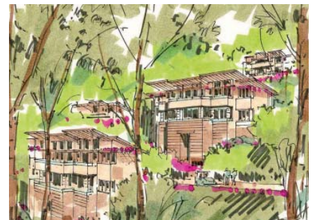
Playa Pelicano Resort Costa Rica