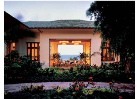
Grand Hyatt Kauai Resort & Spa Poipu Beach, Kauai, Hawaii, USA

This 219-room resort hotel is the gateway to a 310-acre wildlife sanctuary for a threatened species, the Desert Bighorn sheep. The sensitive siting, orientation of buildings, integration with surroundings and low profile of the architecture won the support and approval of a variety of interested parties, including the Bighorns. The property was voted as the number one resort in Southern California and number 10 among the top resorts in North America by Condé Nast Traveler .