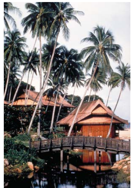
Tanjong Jara Resort Kuala Terengganu, Malaysia