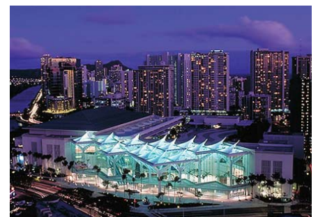
Hawaii Convention Center Honolulu, Hawaii, USA