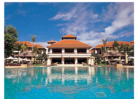
Conrad Bali Indonesia