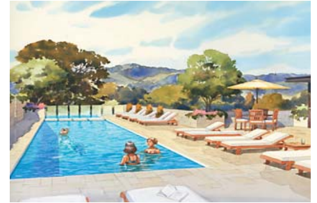
Bardessono Inn and Spa Napa Valley, California, USA

WATG strives to preserve the characteristics of special places wherever they are found--whether on a coastal cliff, in a dense urban setting or on a remote island.