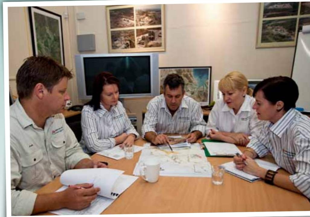
We are keen to work with CQ University, NRM groups and Capricorn Conservation Council to ensure the EIS considers valuable, existing data and research.

Information provided by the proponent in response to the TOR allows government to make a decision on whether to approve the development and if so under what conditions.