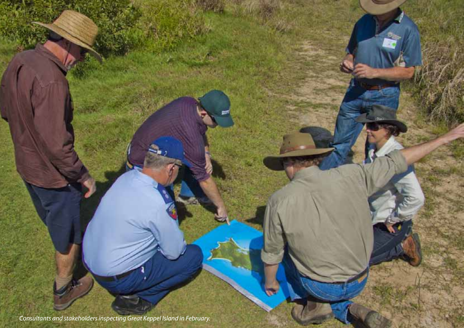
Consultants and stakeholders inspecting Great Keppel Island in February.