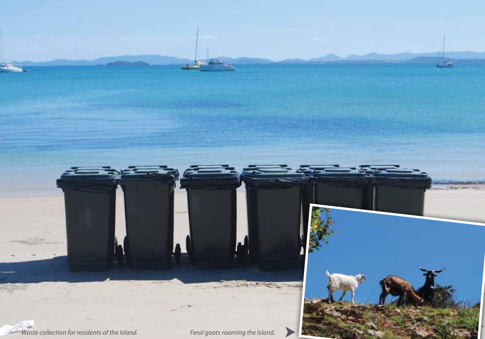
Waste collection for residents of the Island.