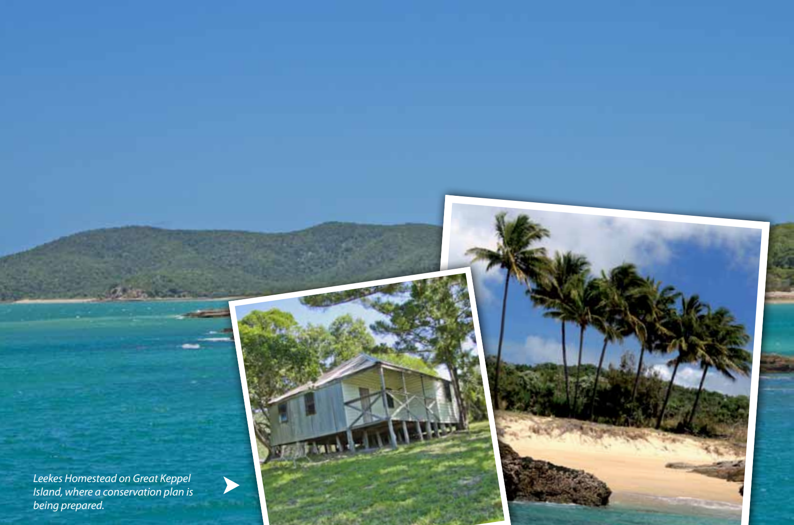
Leekes Homestead on Great Keppel Island, where a conservation plan is being prepared.