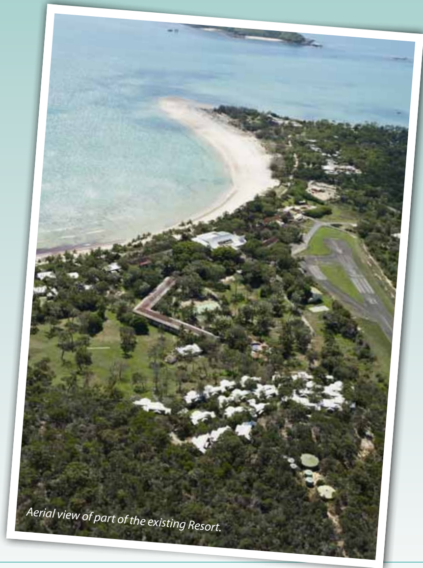
Aerial view of part of the existing Resort.

The public display of the draft EIS will include the constraints mapping and concept designs.